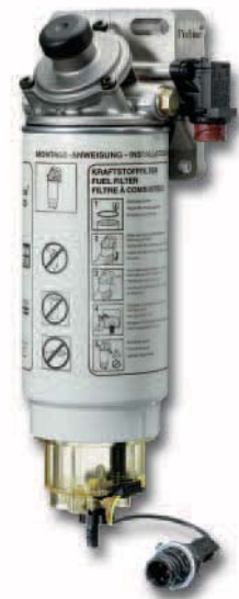
PreLine® 420 with heater and water sensor