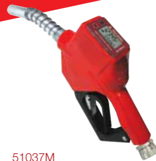
51037M DIESEL NOZZLE WITH METER $403.00