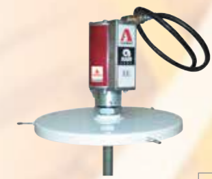
C9979 Alemlube 180KG AIR OPERATED GREASE PUMP