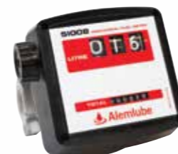
51008 1" MECHANICAL DIESEL FUEL METER $304.00