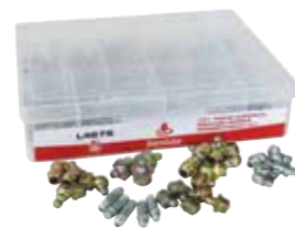
Alemlube GREASE NIPPLE ASSORTMENT KITS