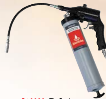
G10030 EL Series AIR OPERATED GREASE GUN