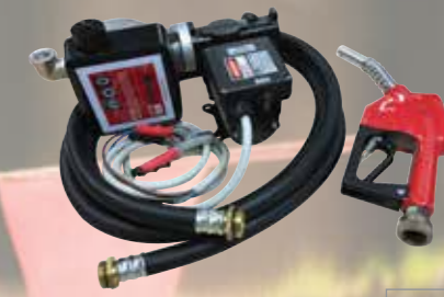
GTA12244560 24V/12V DIESEL REFUELLING TANK KIT $1,739.00