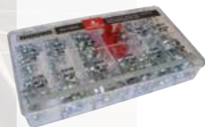
G10090 EL Series GREASE NIPPLE ASSORTMENT KIT