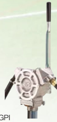
HP100 GPI DUAL ACTION REFUELLING DRUM PUMP $407.00