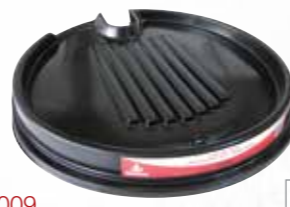
41009 205L DRUM TOP PAN $56.50