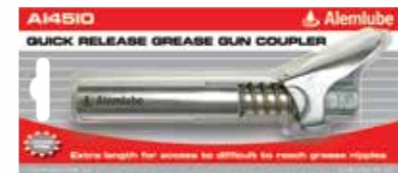
A14510 QUICK RELEASE GREASE GUN COUPLER