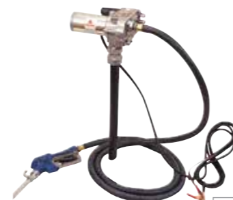
M150SA GPI Heavy Duty DIESEL REFUELLING DRUM PUMP $865.00