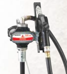
52004A High Volume 12V DIESEL REFUELLING DRUM PUMP $1,269.00