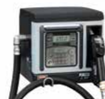
51090 DIESEL FUEL DISPENSER KIT $4,172.00