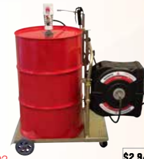
223003 180KG MOBILE GREASE KIT