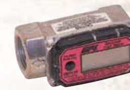
01A12LM GPI 1" INLINE ELECTRONIC FUEL METER $301.00