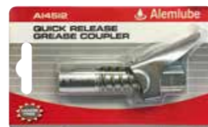
A14512 QUICK RELEASE GREASE GUN COUPLER