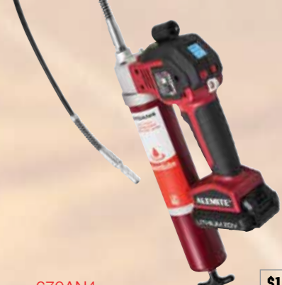
670AN4 20V LI-ION CORDLESS GREASE GUN