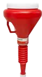
1035OCF CLEAN FUNNEL $12.20