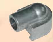
14507 PUSH ON BUTTON HEAD COUPLER