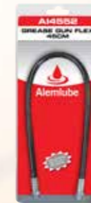
Alemlube GREASE GUN FLEXES