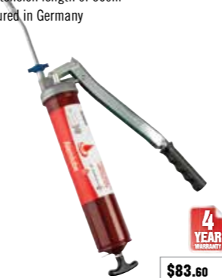
600A LEVER ACTION GREASE GUN