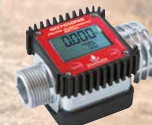
407010N2 Inline 1" ELECTRONIC DIESEL FUEL METER $304.00

GTP12244560 Also available with manual nozzle $000.00