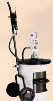
424150 20KG GREASE KIT WITH TROLLEY