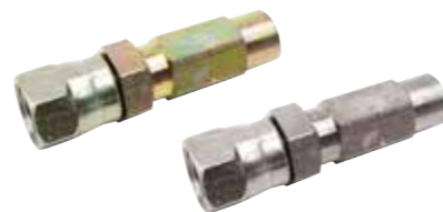
Alemlube REUSABLE HOSE ENDS