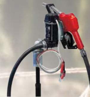
52002A 12V DIESEL REFUELLING TANK KIT $781.00