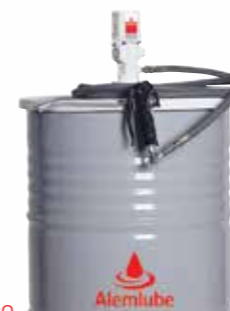
428262 180KG AIR OPERATED GREASE KIT