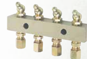
Alemlube HEADER BLOCKS