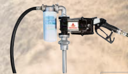
372010 12V PETROL & AVGAS DRUM PUMP $1,135.00