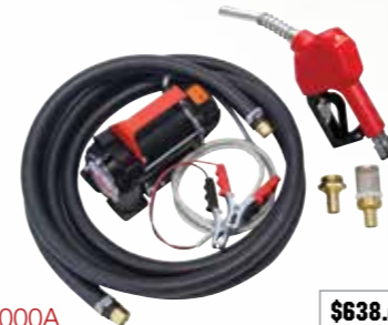
52000A 12V DIESEL REFUELLING TANK KIT $638.00