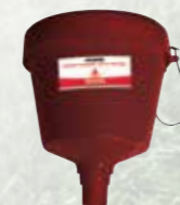
41008 DRUM FUNNEL WITH COVER $43.10