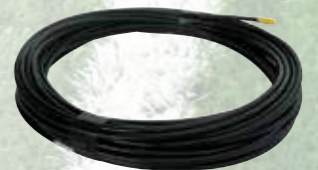
Alemlube GREASE HOSE