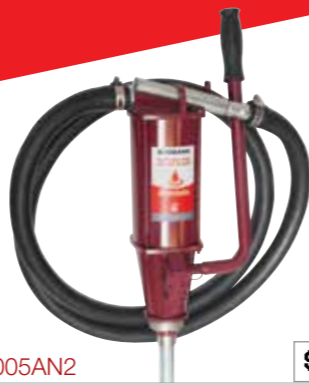
5005AN2 REFUELLING DRUM PUMP $312.00