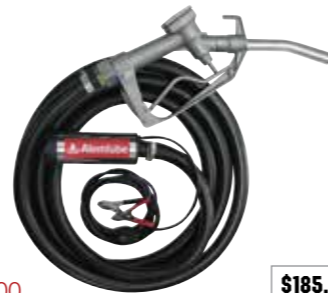
50000 12V SUBMERSIBLE TRANSFER KIT $185.90