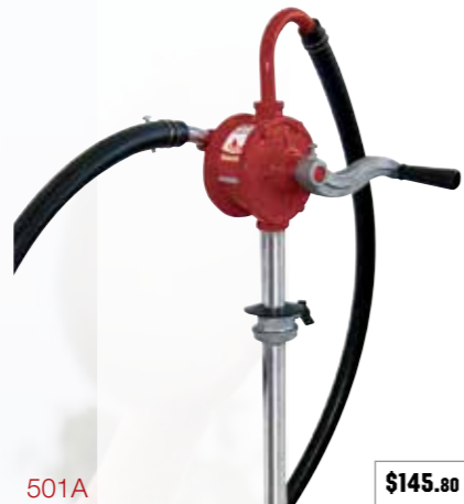
501A ROTARY DRUM PUMP $145.00