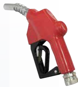
51037 AUTOMATIC DIESEL NOZZLE $272.70