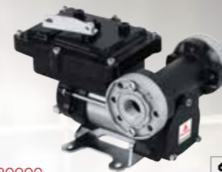
380000 12V PETROL & AVGAS TANK PUMP $858.00