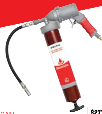
680AN AIR OPERATED GREASE GUN