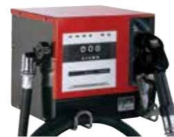
50056 240V DIESEL FUEL DISPENSER $1,563.00