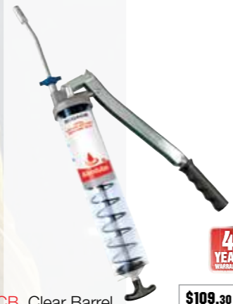
600ACB Clear Barrel LEVER ACTION GREASE GUN