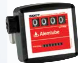
51007 1" MECHANICAL DIESEL FUEL METER $424.00