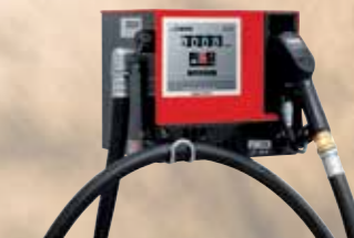
50090 High Flow 240V DIESEL FUEL BOWSER $2,108.00