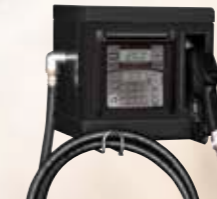
51090-2.0 WI-FI DIESEL FUEL DISPENSER KIT $5,227.00