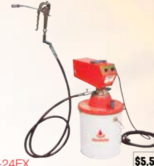
KPL-24EX 24V 20KG GREASE KIT