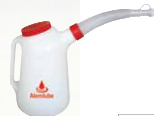
5000MFN OIL MEASURE $39.00