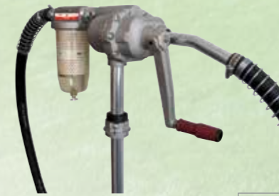
5080AN Hi-Speed REFUELLING DRUM PUMP WITH FILTER $642.00