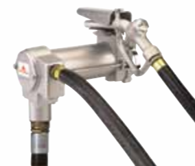
M3425-AL GPI High Volume DIESEL REFUELLING DRUM PUMP $1,337.00