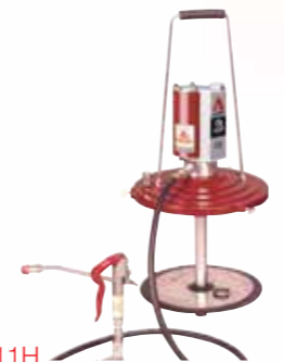
9911H ALEMLUBE 20KG GREASE KIT