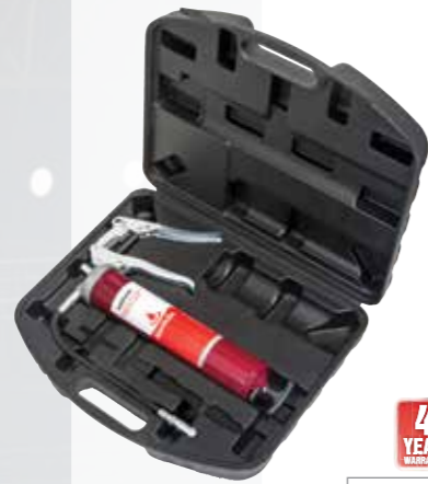
660ANP With Carry Case TRIGGER ACTION GREASE GUN