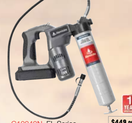
G10040N EL Series 18V LI-ION CORDLESS GREASE GUN