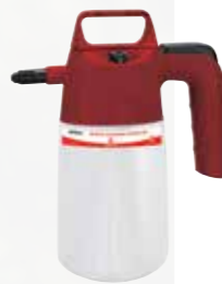
6603A BRAKE CLEANER SPRAYER $46.00