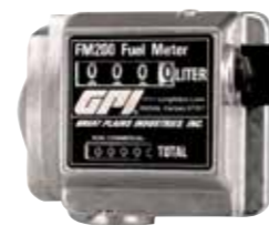
FM200 GPI 1" MECHANICAL FUEL METER $370.00