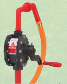
401A 60- 205L Drums RYTON ROTARY DRUM PUMP $272.70