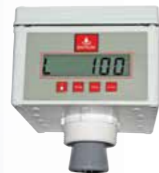
ALS-400/240 FLUID LEVEL MONITORING SYSTEM $1,716.00