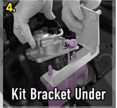
Kit Bracket Under