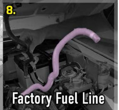
Factory Fuel Line