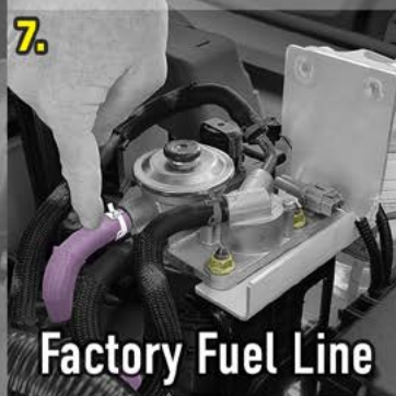
Factory Fuel Line