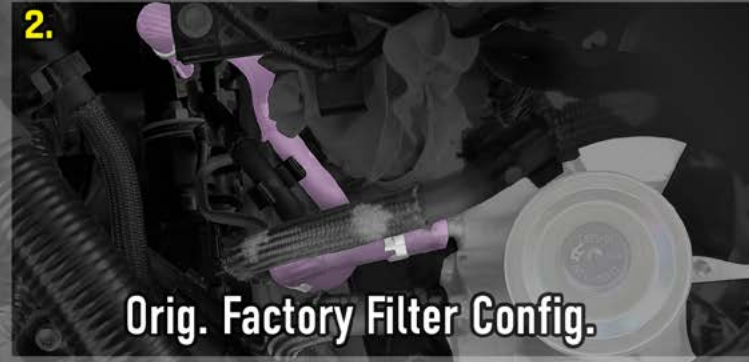
Orig. Factory Filter Config.