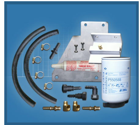
KIT No: 05-PROV-06-FS

NOTE: Periodically check the clear fuel bowl for any water caught and drain when necessary.